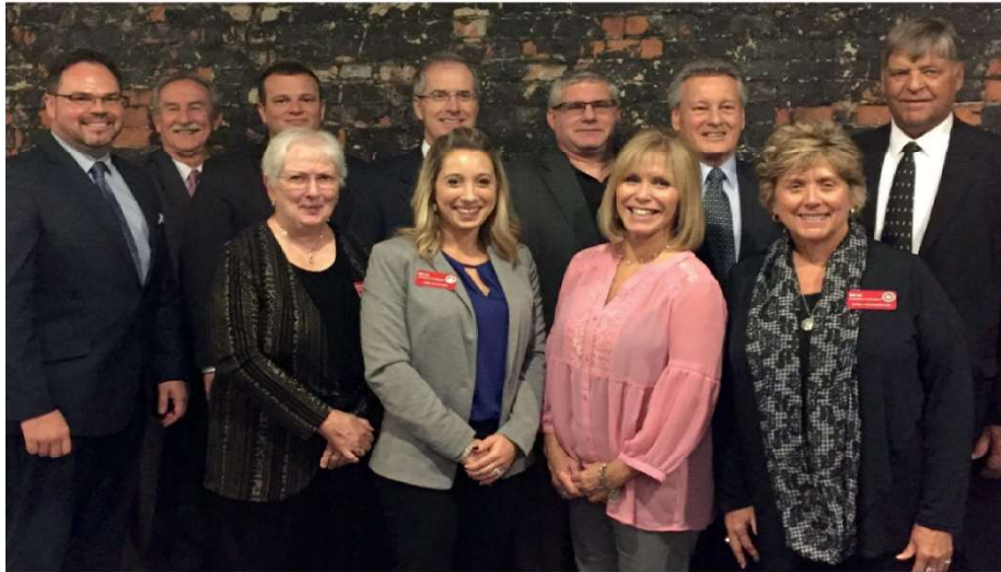
2017 Academic Foundation Board