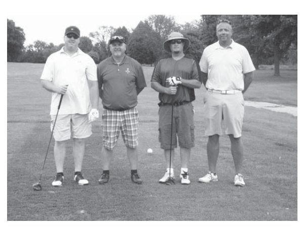
Cyr Foursome - 2nd Place